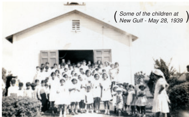
( Some of the children at New Gulf - May 28, 1939 )

difficult to understand. Here I was, all alone, trying to save thousands of souls and there were hundreds of Basilians doing nothing during the summer, yet none were sent to stay with me. And yet, he had just sent six men to Europe to study for higher degrees. I told him that with all these souls to save, he sent one priest to Rosenberg to save thousands and a half dozen priests to prepare to teach a few so-called "brains" at the Institute. I told him of the decision I had been forced to make with the Bishop, to go it alone, and then I told him I had no money.