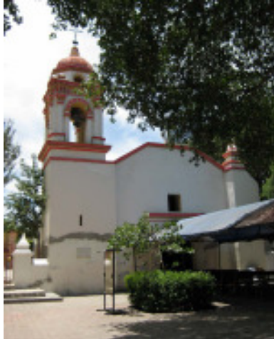
San Lorenzo Church

San Lorenzo Parish in Tehuacán was entrusted to the Basilian Fathers in 1978. Through the years, we have been busy building a new church to replace the small, aged 17 th century building, and constructing the chapels Santa Cecilia and San Juan Diego in Vista Hermosa.