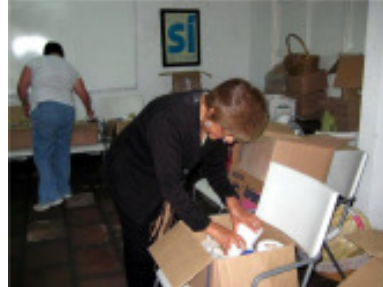
Volunteers packing cartons of necessities at the Parish Center for the poor

psychological, and other services are offered to those of limited material resources. The poor come from their colonias to receive healthcare and packages of items for cooking, household, and personal use, prepared by volunteers at the Parish Center. Many supplies, such as the stethoscope and blood pressure cuff used by Dr. Javier Noriega, are purchased with profit distributions from Saint Basil Coffee.