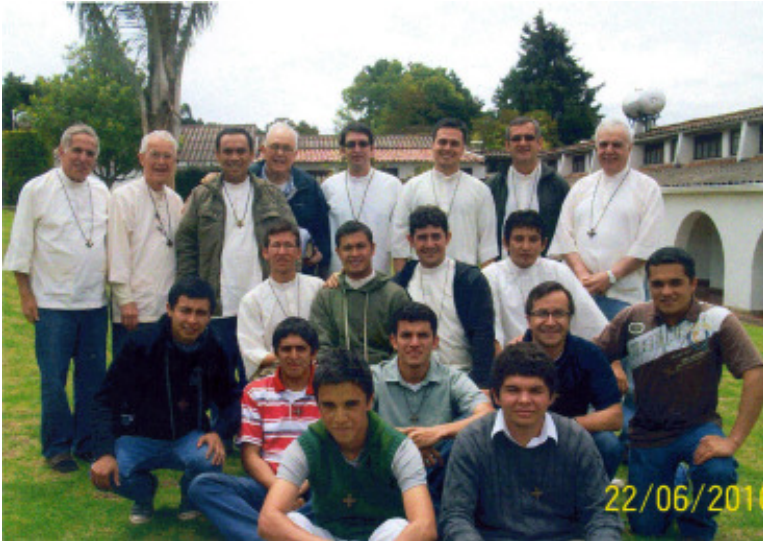
Basilian Annual Retreat, Benedictine Monastery, Bogotá